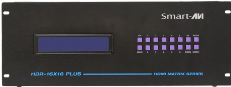
HDR 16x16 Plus Front