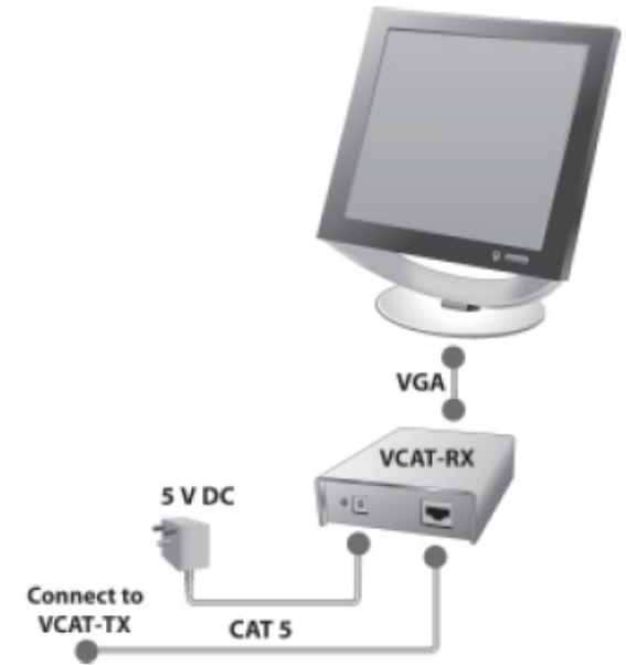
VCAT Receiver Installation Diagram