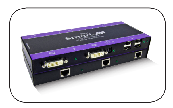
Dual DVI-D and USB 1.1 Extender up to 275 feet over STP Cable