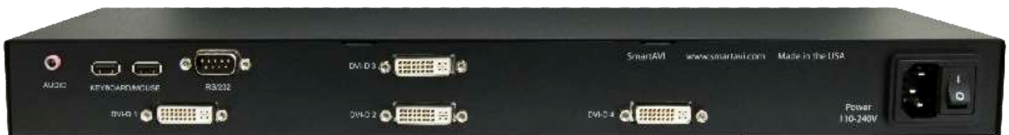
FDX-M4U Receiver Rear