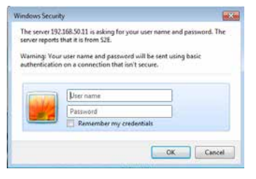
Figure 5-1: SmartAVI HDR-8X8 Plus Login Webpage

Enter the IP address in a browser of your choice and the Web Control login screen should appear as shown in figure 5-1.