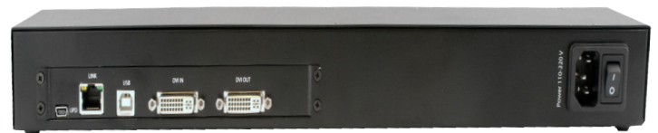
KLX-500-IU (TX) Back