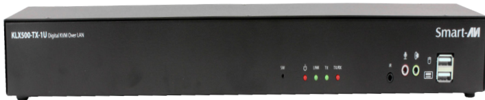
KLX-500-IU (TX) Front