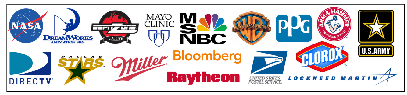
Designed and Manufactured in the USA

Many leading companies have recognized and embraced the innovation of SmartAVI's technologies and have successfully incorporated them into their organizations. Users of SmartAVI include: