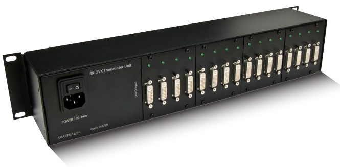
RK-DVX200 Transmitter (Rear)

The RK-DVX200 rack extender can be implemented in three ways. First, the rack device can be used as a transmitter, extending signals to multiple small receivers (DVX-RX200). Second, the rack device can be used as a receiver, taking in signals from multiple small transmitters (DVX-TX200). Third, the rack device can be used in tandem with another rack device.