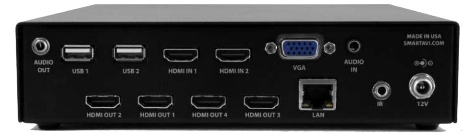
EZ-Wall 2X2L Rear