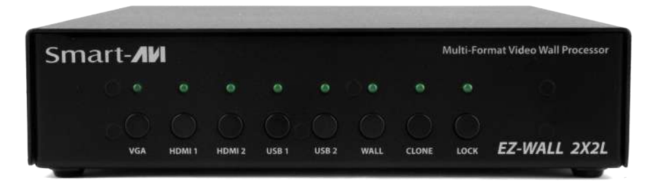
EZ-Wall 2X2L Front