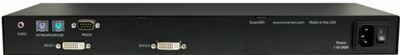
FDX-M2P Receiver Rear