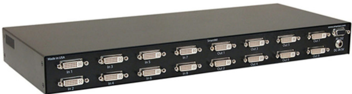
DVR 8X8 Back panel