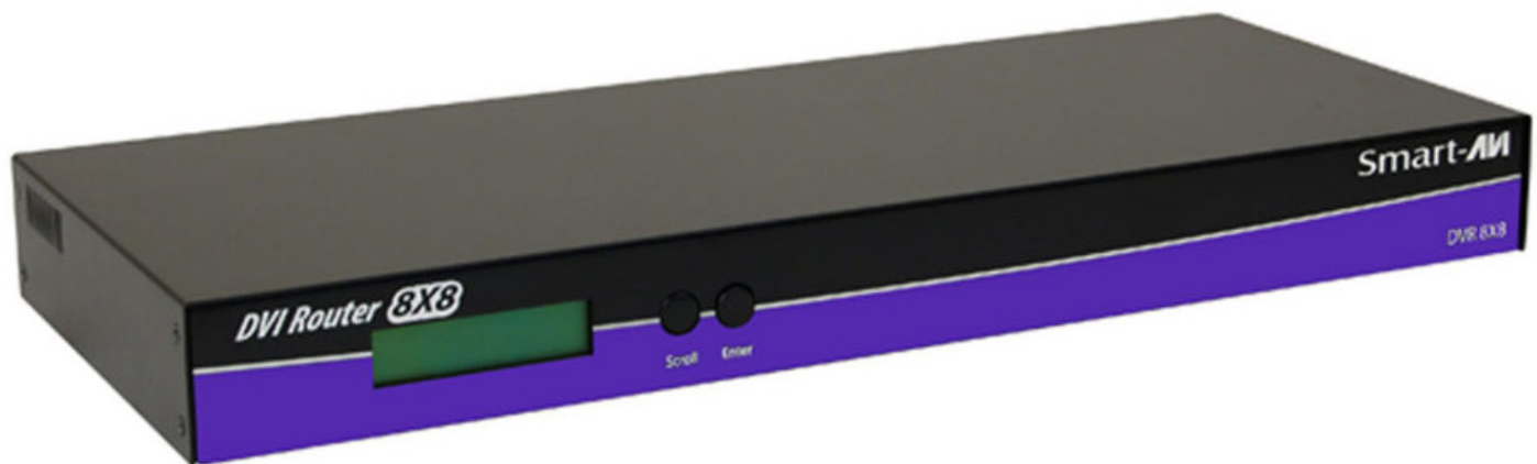
DVR 8X8 Front panel