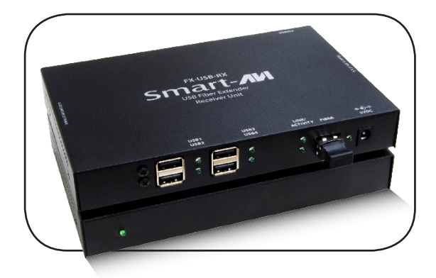
USB 2.0 Extender up to 1,500 feet over Fiber Optic Cable