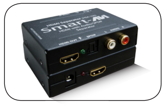
HDMI to HDMI with Audio/SPDIF Converter