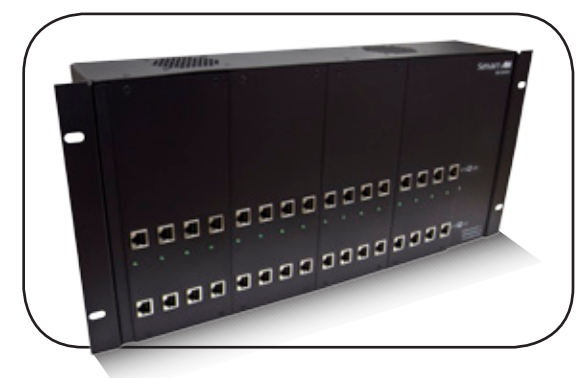
16-Port Dual DVI-D and USB 1.1 Extender up to 275 feet over STP Cable

16-Port Dual DVI-D and USB 1.1 Extender over STP