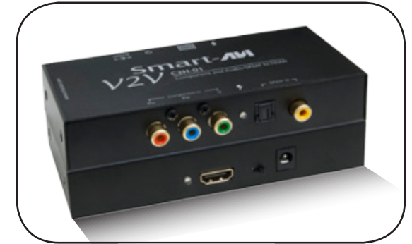
Component to HDMI Converter