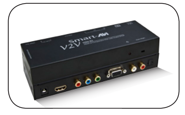
HDMI to Component/VGA Converter