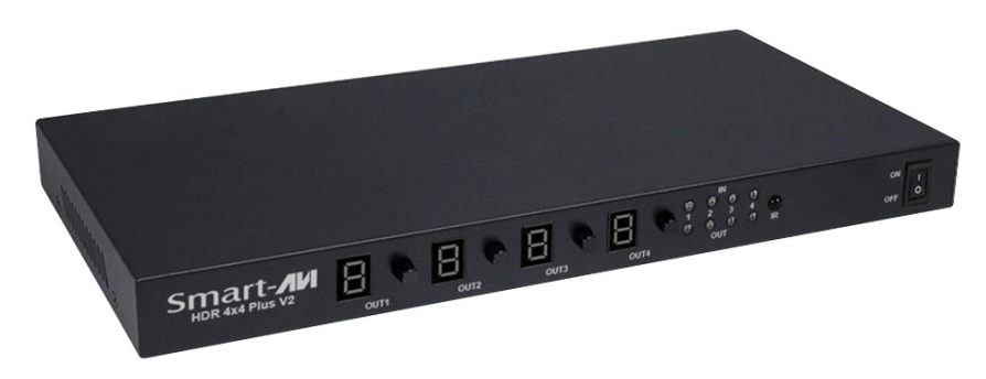
HDR-4x4 Plus V2 Front