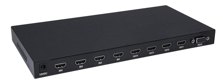
HDR-4x4 Plus V2 Back