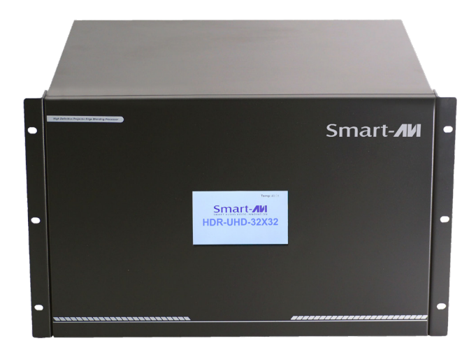
HDR-UHD-32x32 Front panel