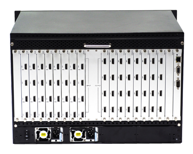
HDR-UHD-32x32 Back panel