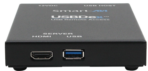
USBDEX (Front panel)