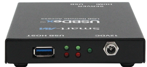
USBDEX (Back panel)